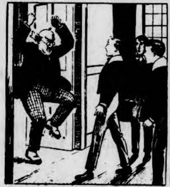
As Amusing Incident in our Spiendid Complete School Tale Tom Merry & Co. estate 1 "THE TERRIBLE THREE'S TRIUMPH: