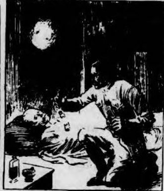
A Dramatic S. ene in our Thrilling Complete Adventure Scory Jack, Sam. and Pete gatelled "BY WHOSE COMMAND!